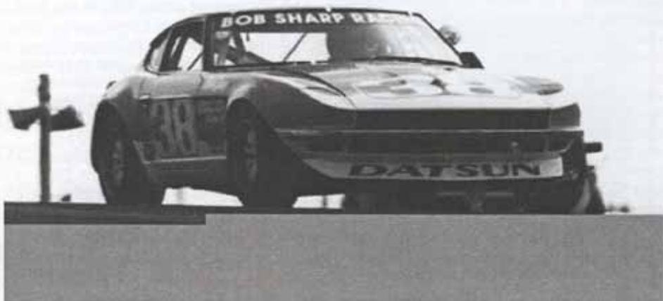
A shot of the original 1970 BSR Datsun 240Z