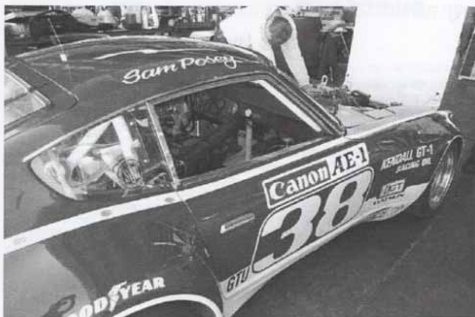
Sam Posey was among the legends to drive the BSR cars