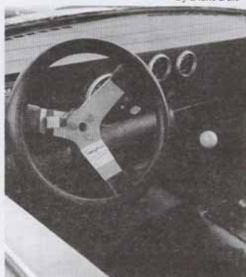
Straight and simple – the basic interior holds a custom dash and essential gauges