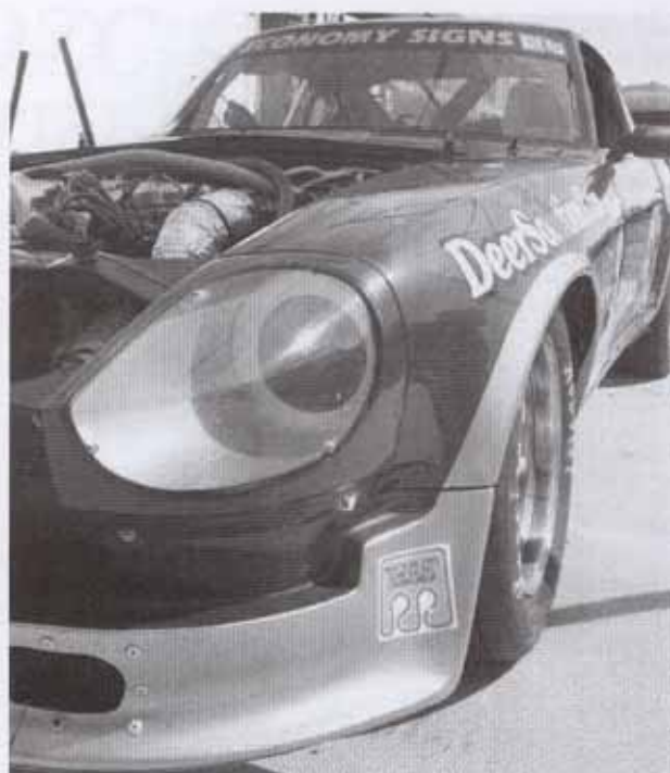
Looking into the eye of the storm – the smart styling of this 240z looks fantastic on the track